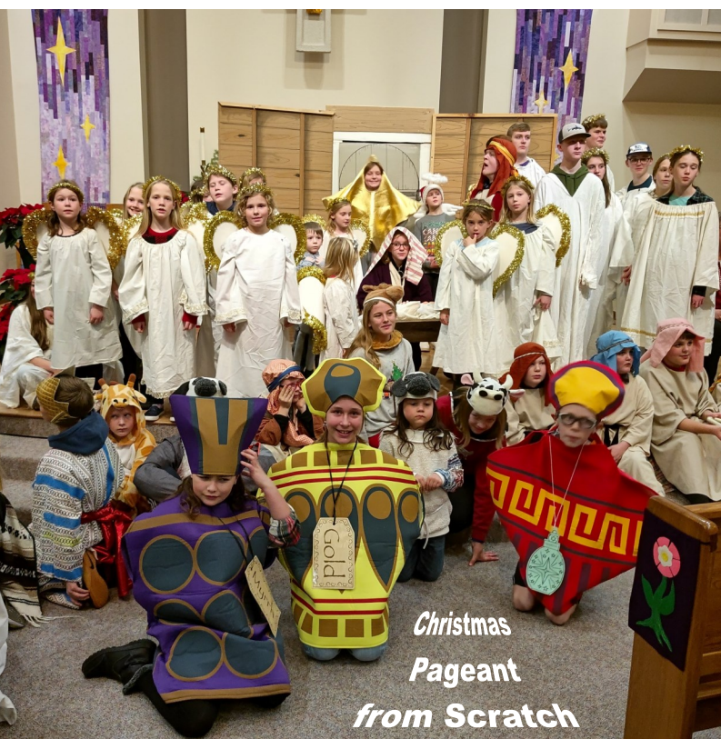
Christmas Pageant from Scratch

Jesus continued working in the lives of kids during 2022 at our fun weekly meetings. Journey Kids' Club provided a place on Wednesday evenings where kids could come, play games, have a meal together, and learn more about Jesus through a lesson and songs. J.A.M. (Jesus and Me) Sunday School has been a fun time of crafts, music, and Bible lessons during Sunday morning worship services. The kids get time in large and small group formats, and there is real spiritual growth happening. Other highlights of the year have been the Advent Fair, the Christmas Pageant from Scratch, and that the kids have helped to lead worship. It's been a great year!