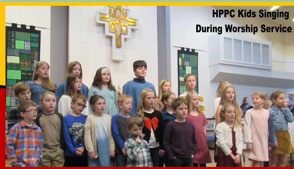
HPPC Kids Singing During Worship Service